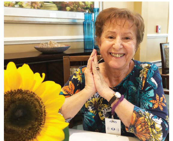
A new adventure awaits!