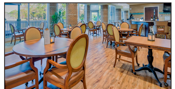
LEFT: Jennifer Rapp with Cypress Village Loon's Nest Pizzas, ready to make deliveries to local first responders. ABOVE: The Loon's Nest Bar and Grill at Cypress Village