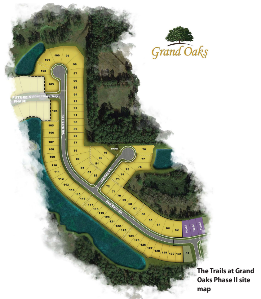
The Trails at Grand Oaks Phase II site map

The Trails at Grand Oaks is located at 23 Myrtle Oak Court, St. Augustine. For more information, call (904) 644-1920 or go to www.pulte.com .