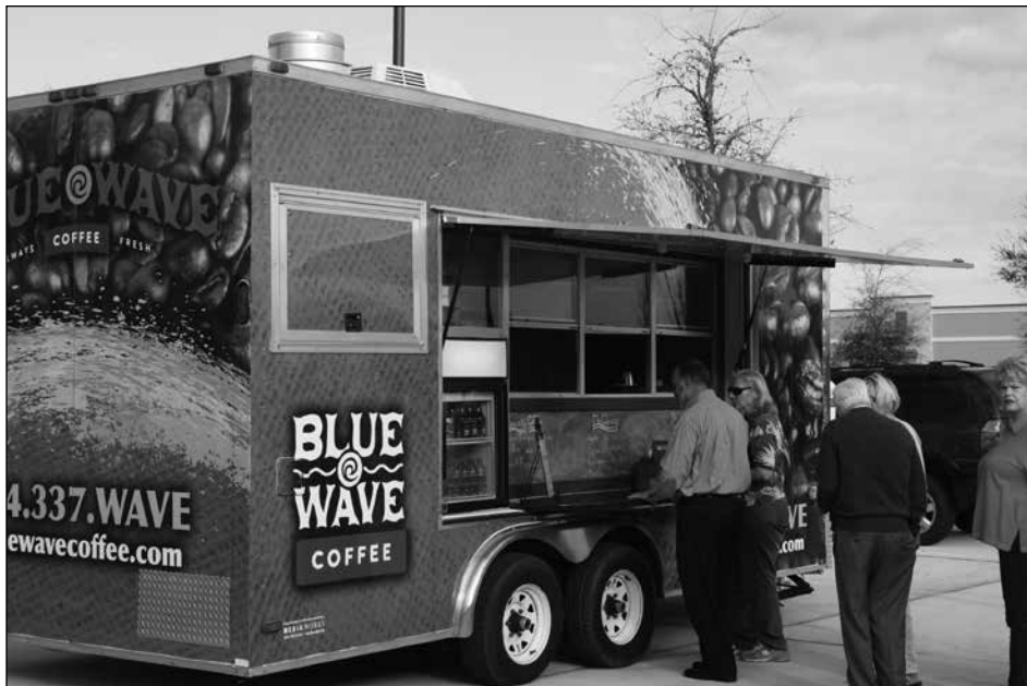
Blue Wave Coffee truck