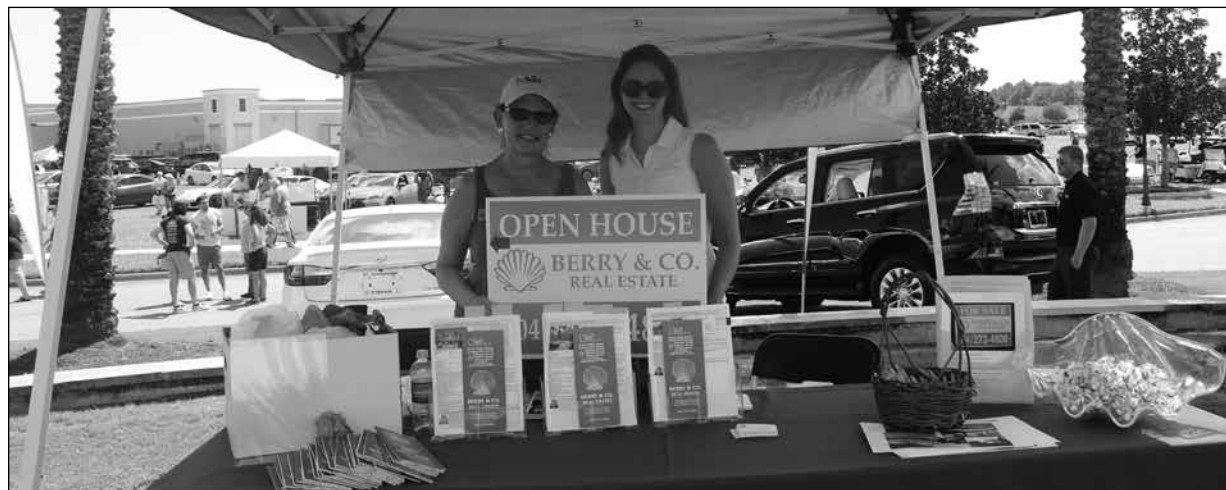
Berry & Co Real Estate

Sponsored by the St. Johns County Chamber of Commerce, the annual Ponte Vedra Auto Show regularly attracts thousands of attendees. This was the first year the event was held at Nocatee Town Center.